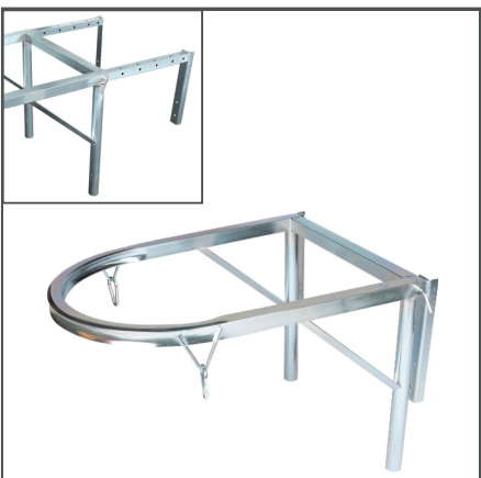
Sturdy and galvanized steel suspension frame with adjustable mounting depth.