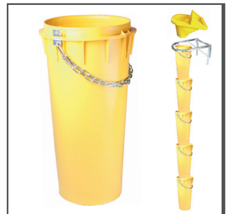
Stable drop pipes made of sturdy Polyethylene plastic (HDPE), inclusive metal chain and carabiner hook for easy hook in.